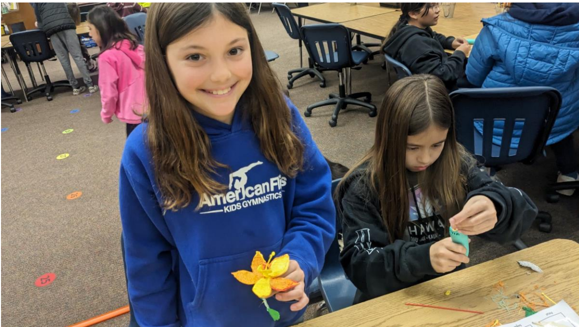
Pictured are LAE students showing off their flowers created using 3D pens purchased with LAEF grant funds.