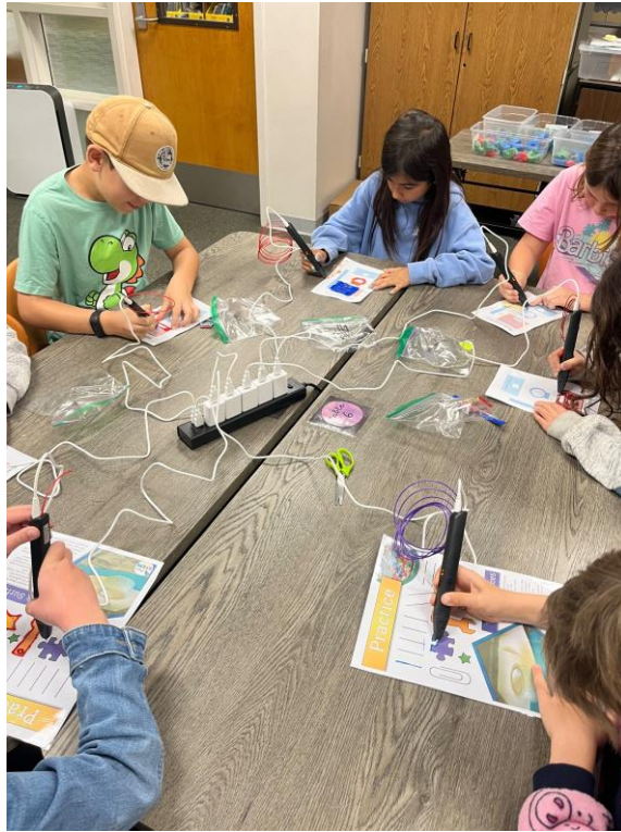
Pictured are McGaugh students using 3D pens purchased with LAEF grant funds.