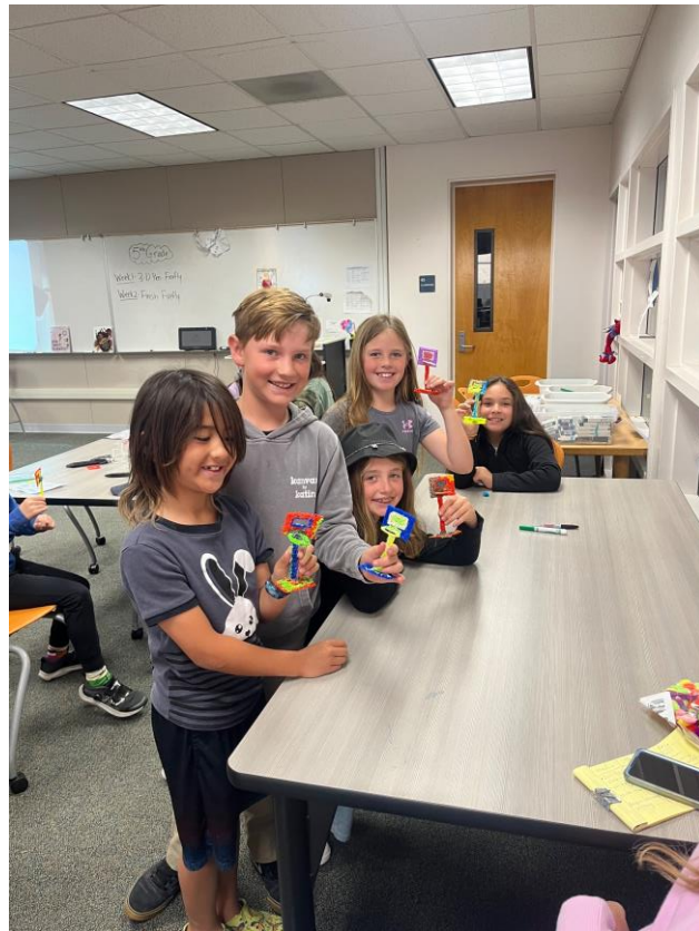
Pictured are McGaugh students showing off basketball hoops created using 3D pens purchased with LAEF grant funds.

LAEF is the non-profit partner of Los Alamitos Unified School District. LAEF enhances educational excellence by providing after-school and summer enrichment programs to children in grades Pre-K to 12. LAEF impacts all students by providing significant funding for student mental health/wellness and STEAM instruction, as well as igniting new programs and providing valuable resources. For more information, visit www.LAEF4kids.org or call (562) 799-4700 Extension 80424 today.